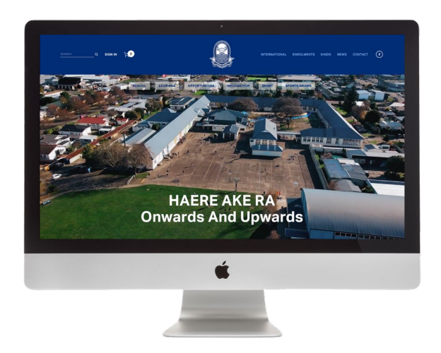
Visit our website for comprehensive school information and news